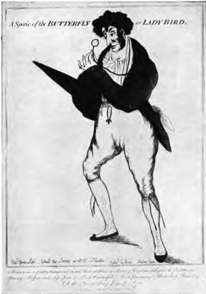
CARICATURE OF SIR LUMLEY SKEFFINGTON AS "THE SLEEPING BEAUTY"